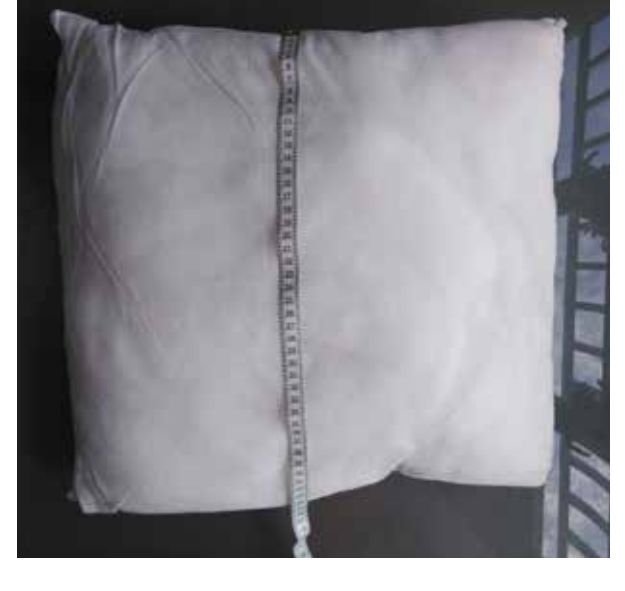
Measure cushion size. (instructions based on 44cm x 44cm).