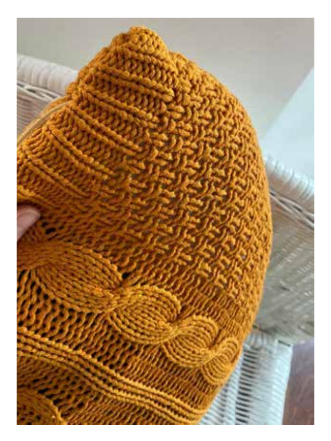
Turn your cushion cover inside out and push out all of the corners.

You can use fingers, or scissors, but be careful not to damage the knit.