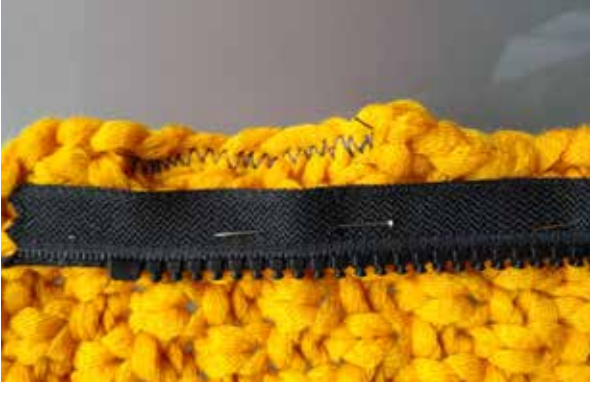
Once zip is sewn, line up both layers of fabric with the wrong side on the outside.

Note: It will be easier to finish the cushion if your zip is slightly shorter than the fabric width.