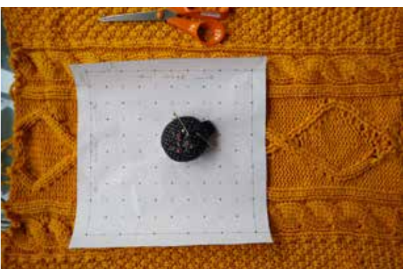
Place your paper pattern on your jumper or knitted wool fabric.

Pin around the paper and cut out the fabric.