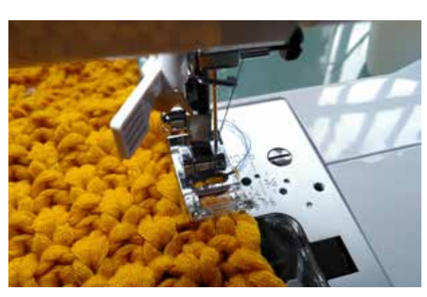
Zig Zag stitch around all 4 sides of your fabric.

You will need to cut 2 fabric squares of this size. We have used the same fabric for both front and back of the cushion, but you can use 2 different fabrics for your cushion.