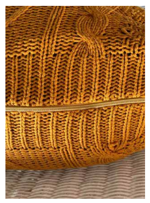
STEP 9: Place cushion into the cover and zip up.

You can use fingers, or scissors, but be careful not to damage the knit.